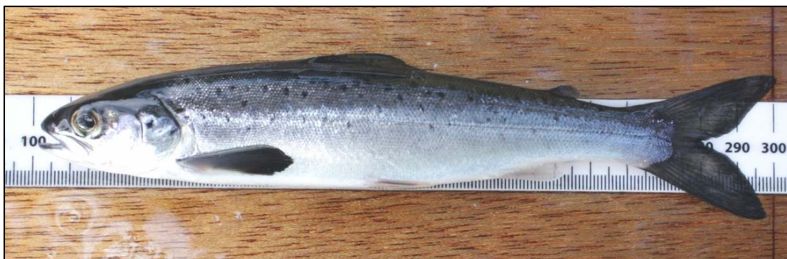
Late salmon smolt, taken in downstream trap at Tournai in July 2008.

All FMPs present a list of recommendations for actions to improve the productivity of respective fisheries. These, and examples of actions subsequently taken are reviewed in the sections below.