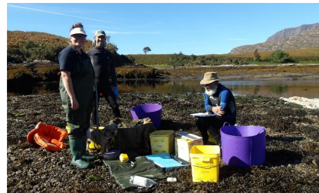
Team photo 18 Sep 2024

Sea trout 280mm, Kanaird 18 September 24