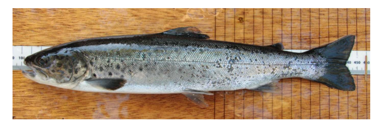
Sea trout, 333mm, caught in the upstream trap at Tournaig, Loch Ewe on 30 September 2010