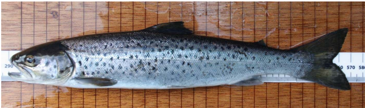
Sea trout, 265mm, upstream trap Tournaig, 3 Sept 2007, Loch Ewe