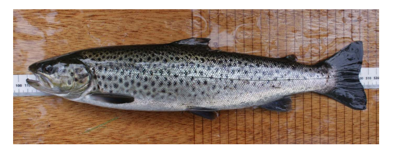
Sea trout, 382mm, caught in the upstream trap at Tournaig, Loch Ewe on 30 August 2008