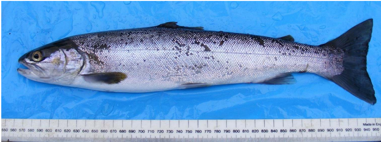
Sea trout, 381mm, 471g, River Kerry mouth, 21 st February 2011