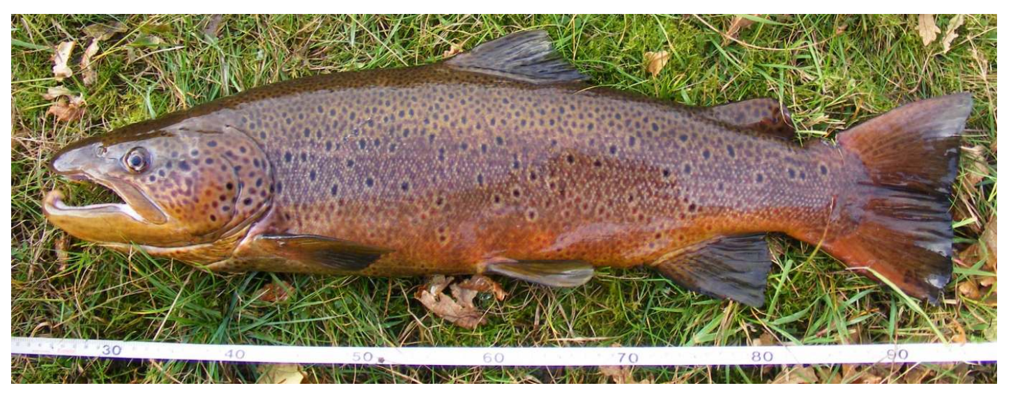
Trout, 700mm, estimated 4.5kg, spawning burn in Loch Maree catchment, 25th October 2011